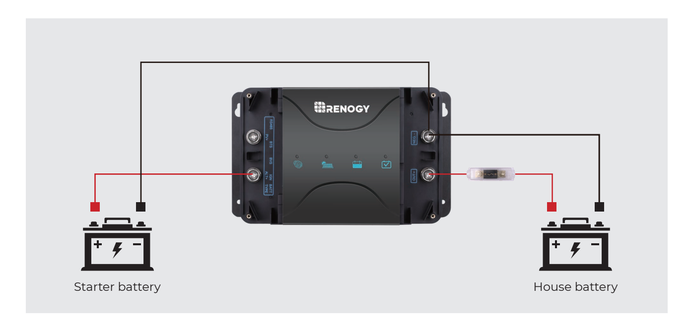
Diagram of Fuse Connection